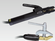
MMA kit 500A - 4 m - 50 mm 2 047419