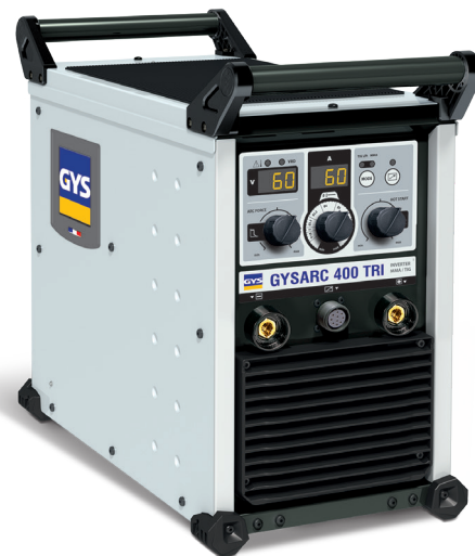
Supplied without accessories